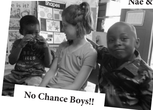
No Chance Boys!!